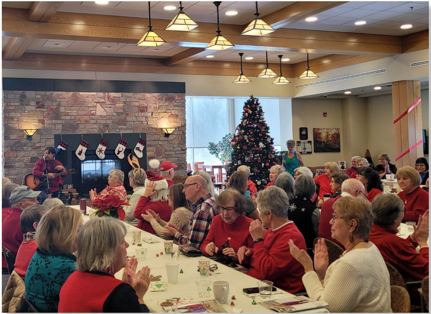
A holiday party at the Lodge, 2022