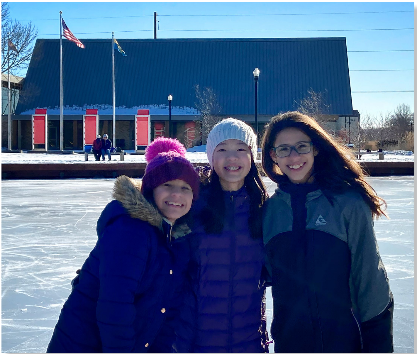
Ice Skating at Firemen's Clayhole, 2022