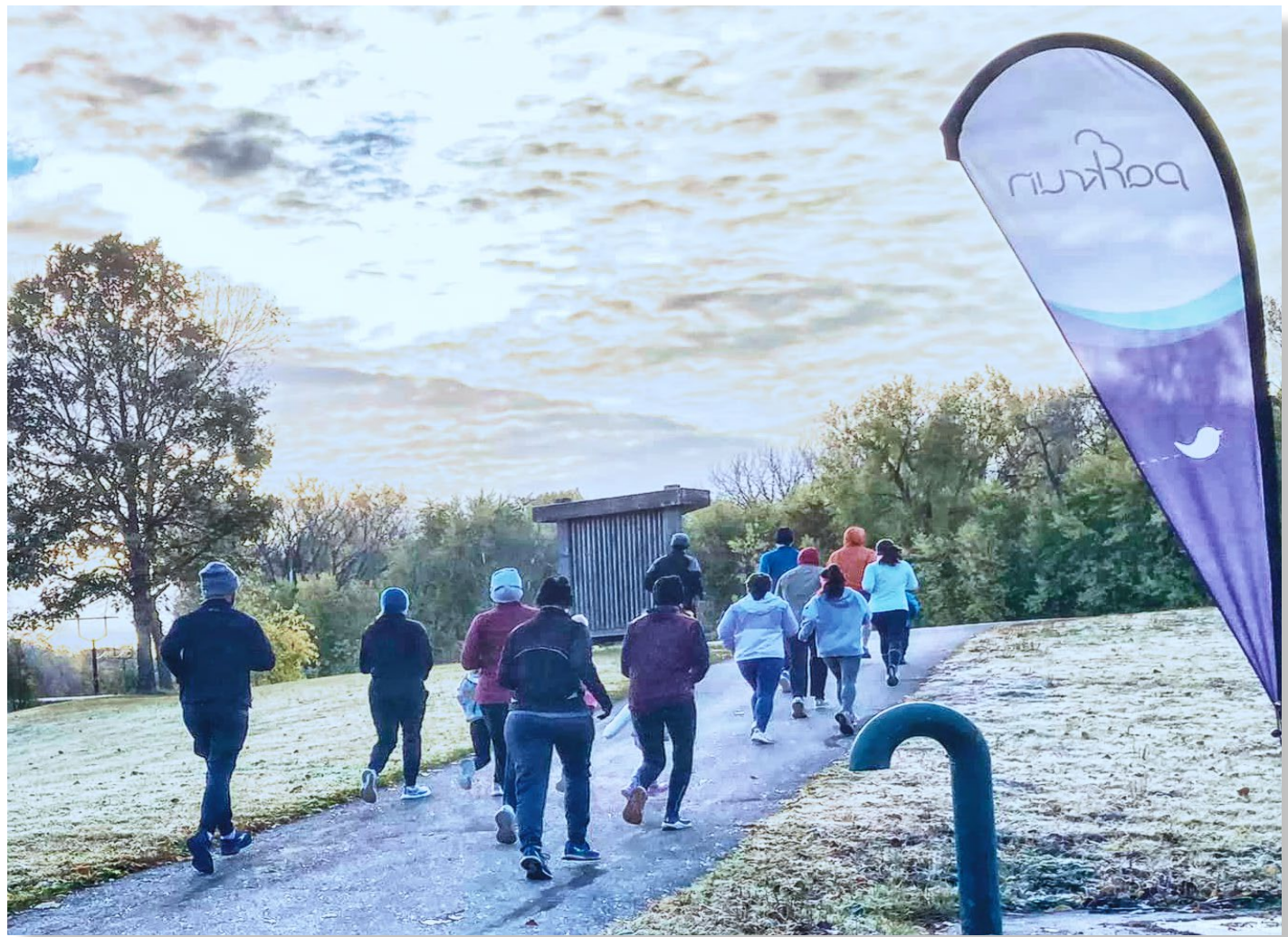
Runners participate in a weekly courthouse Parkrun through the Chaska trail system.