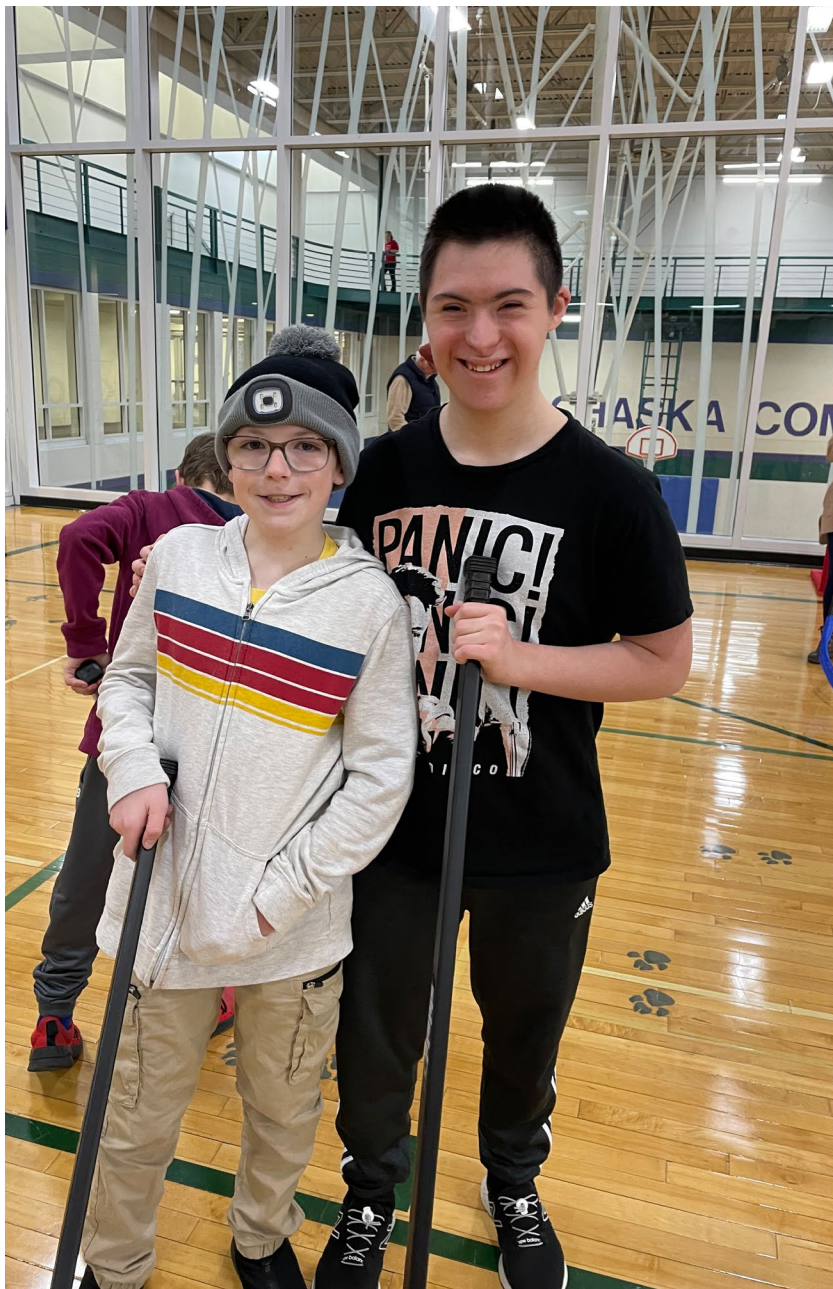
Adaptive Floor Hockey at the CCC

Mon Jan 22 8:30am-4:00pm Resident: $55.00. Non-resident: $60.00